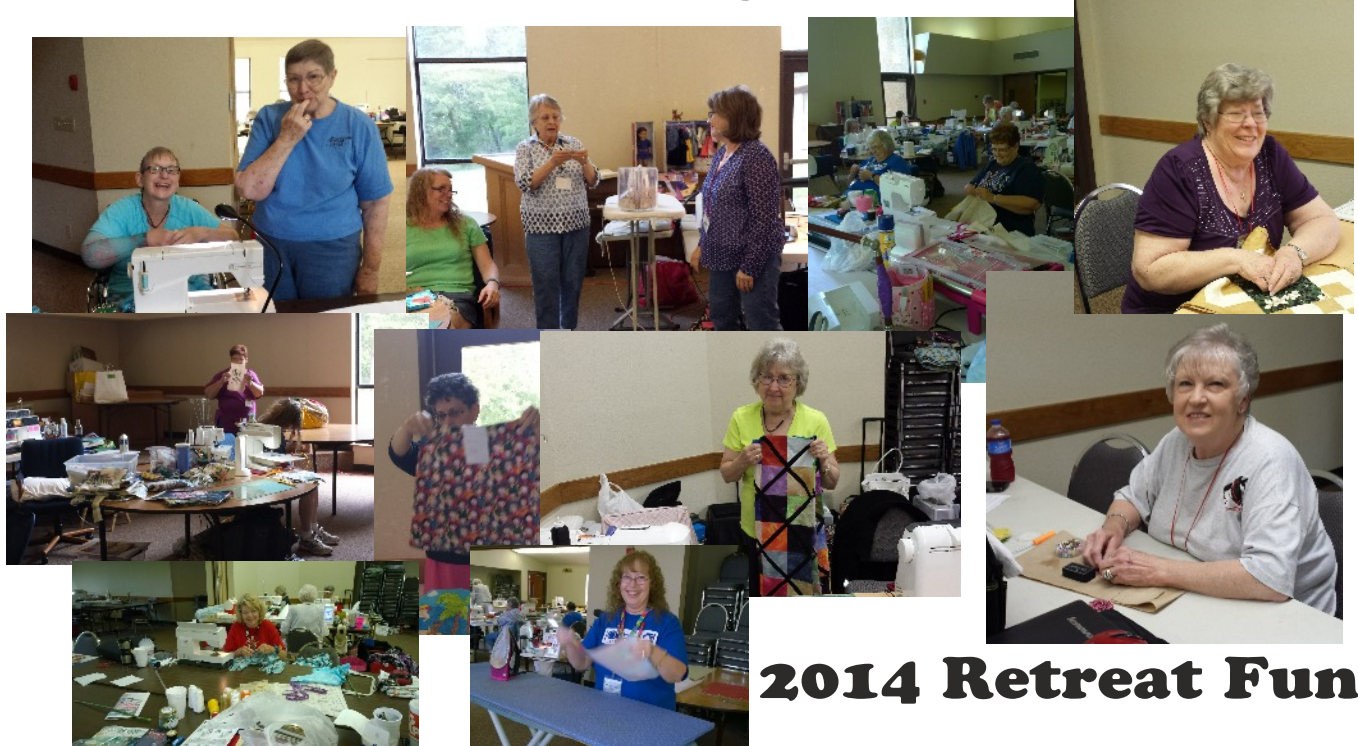
2014 Retreat Fun